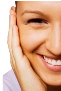
Safe and effect results for you

Oxy-Oxc™ – When the bowels are moving at least once or twice a day the ability to get rid of toxins increases and aggravating behaviors decrease. Constipation causes toxins to be reabsorbed into the body. Oxy Oxc cleans out the colon and bowels.